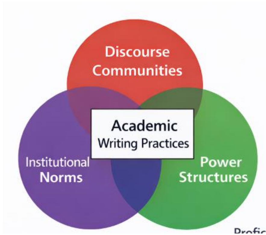
Figure 2. Academic Literacies Model in Multilingual Contexts