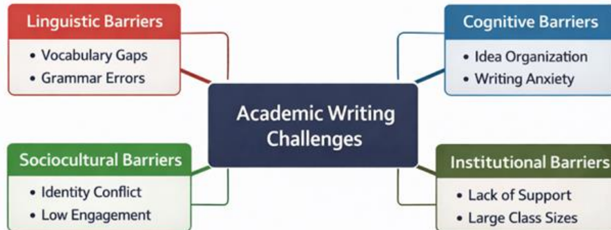
Figure 5. Multidimensional Barriers to Academic Writing